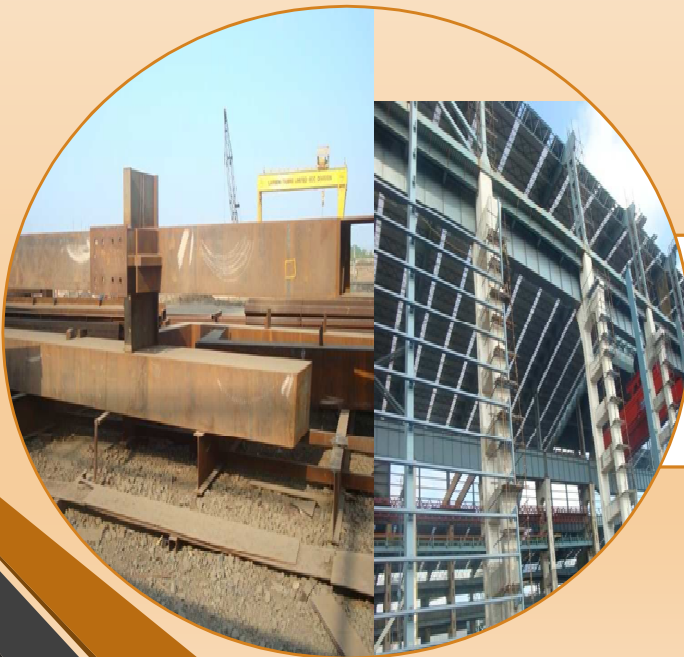
Fabrication & Erection

Fabrication of heavy/medium/light structures including rolling, blending, drilling on all types of Structural sections, plates, pipe section etc. of all thickness & material grade